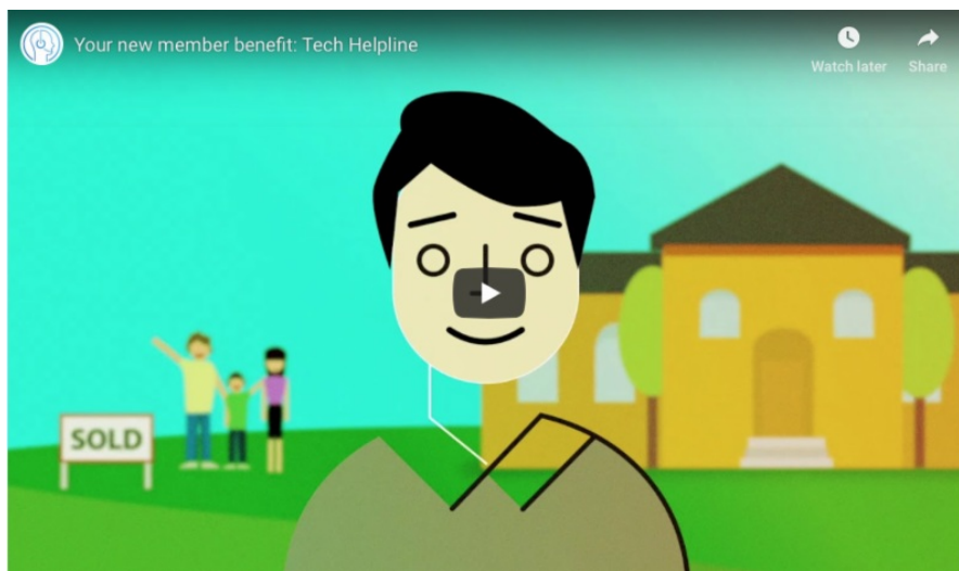
An SFAR Member Benefit_ The Tech Helpline

Slow computer? Printing issues? Browser headaches? Smartphone questions?